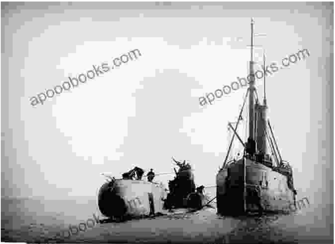
Thetis Down: trapped inside a sinking submarine

On June 1, 1939, the Thetis embarked on a routine training exercise in Liverpool Bay. On board were 99 souls, a crew eager to test the limits of their vessel. As the submarine descended into the depths, disaster struck. A faulty valve allowed seawater to flood into the engine room, crippling the vessel and trapping the crew inside.