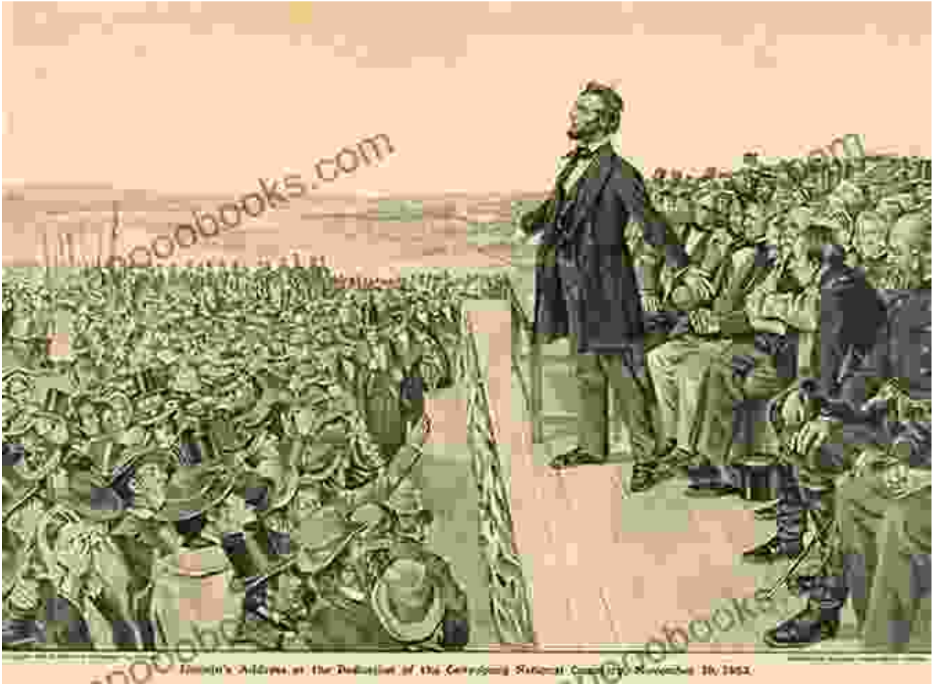
Lincoln's Address at the Dedication of the Gettysburg National Cemetery, November 19, 1863.