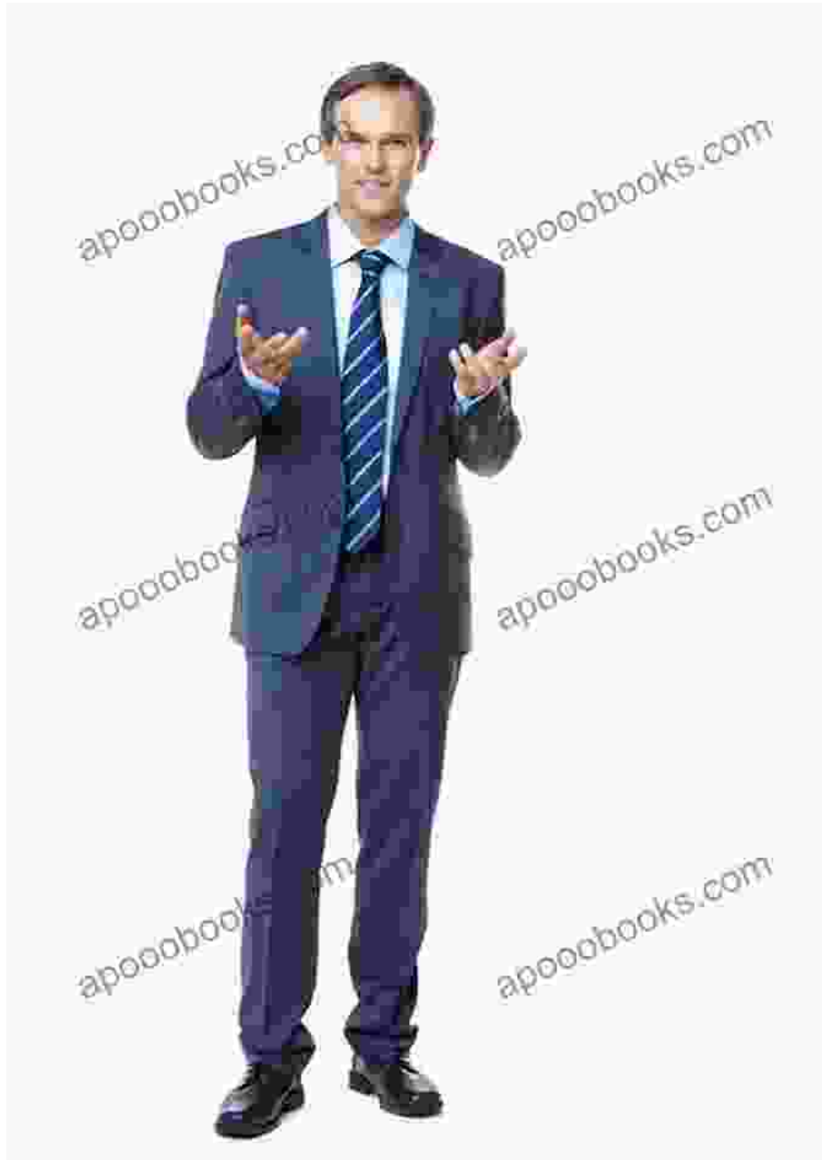
Dominant and Authoritative Stance

Your posture speaks volumes about your confidence and accessibility. Maintain an upright stance with your shoulders back and relaxed. Open your chest and avoid crossing your arms or legs, as these gestures can create a barrier and make you appear aloof.