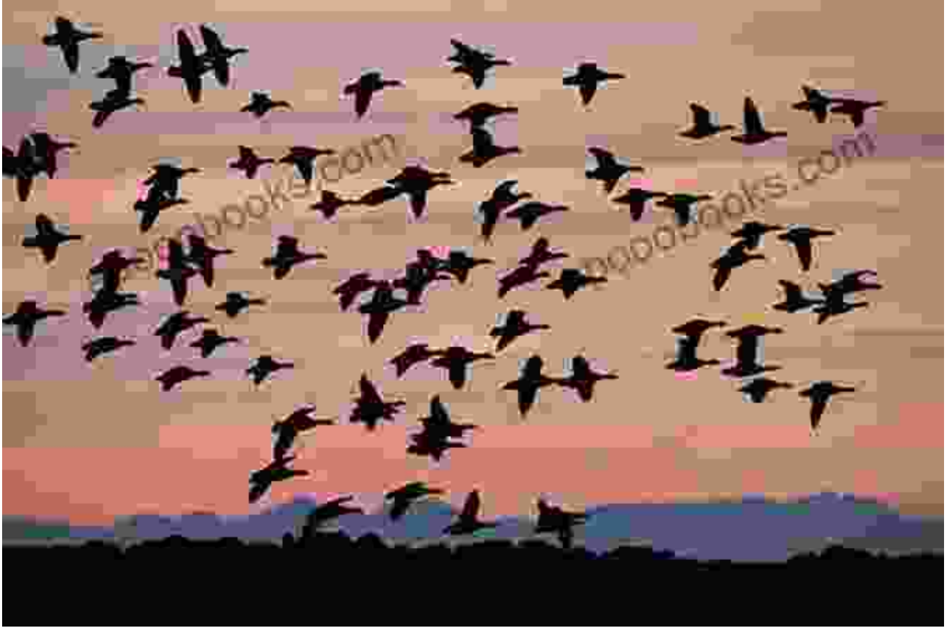
The majestic flight of a flock of geese.